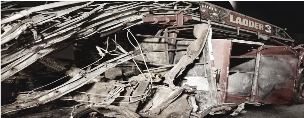
firetruck 9.11 memorial.jpg