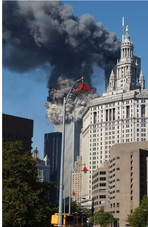
Owned, Stock Image, World Trade Center, Sept. 11, 2001bigstock-Collapse-of-World-Trade-Center-15530933.jpg

No more than 30 minutes from the south tower being hit, the Pentagon in Washington D.C. was then hit by another plane. By 10:07 on Flight 93 Passengers and crew members had learned about the other attacks and attempted to retake the plane. The plane was then crashed into a field in Pennsylvania by the hijackers.