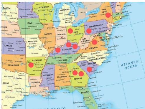
Each dot represents where Semper Tek's current employees were on Sept. 11, 2001, IMG_1779.jpg

Because people were in disbelief and in shock that something like this could happen it humbled the nation and individuals to see other things of great importance other than just themselves.